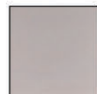
Trans White (Wood Grain Shows)