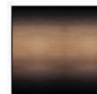
Natural to Black Burst